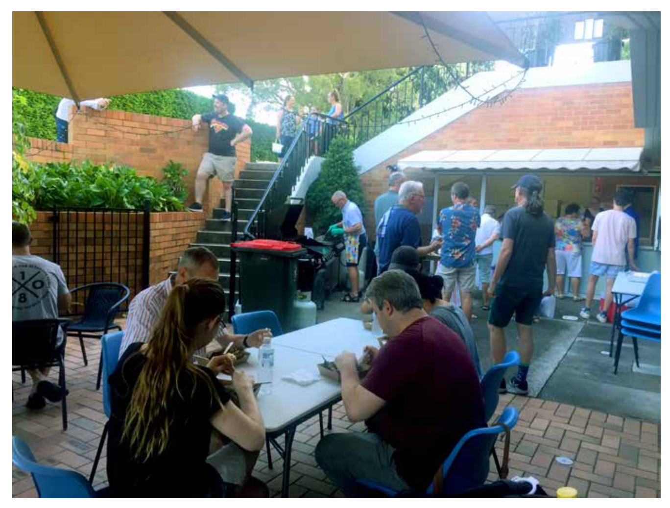
Our Vision & Planning Day on 6 February, 2021. How great it was to plan and pray together for the year and years ahead!