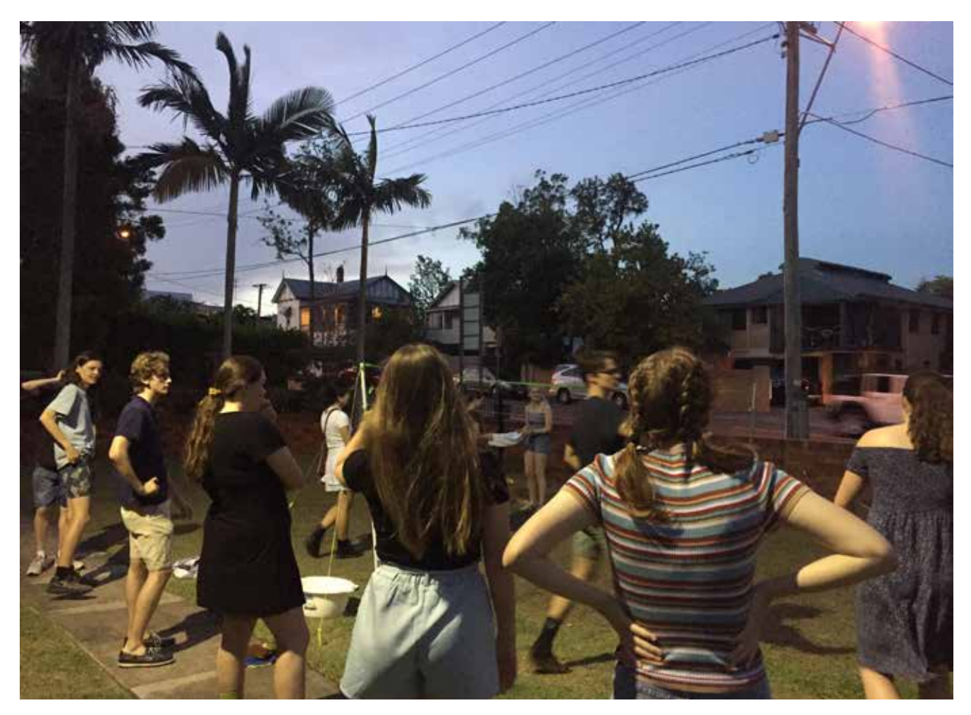
One of the final Senior Youth gatherings in 2020 where the group started off the night with a (competitive!) game of water balloon volley ball.

Our first onsite Playgroup sessions after lockdown were met with tears of joy as we welcomed families back. We were immediately struck with the difficult positions almost all families faced being stuck in Australia during the pandemic unable to see their families at home and anxiously watching infection rates skyrocket in many of those countries.