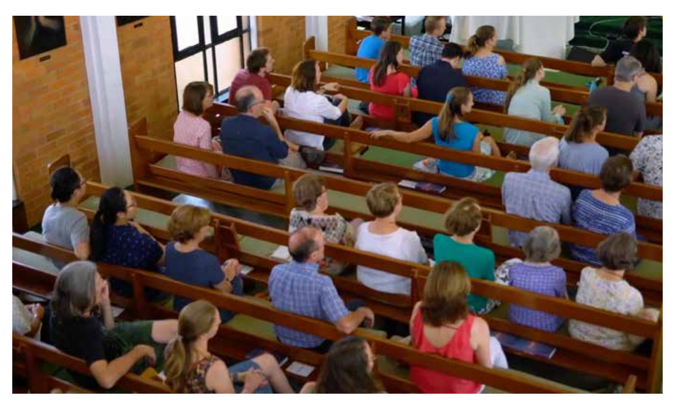
A photo of Sunday worship taken in early 2020 before the global pandemic.