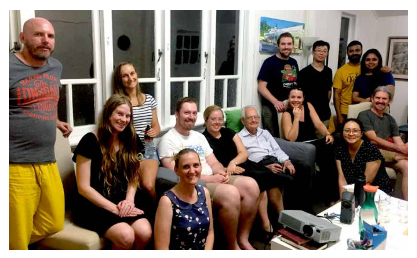
Above is a photo from 18 February, 2020. Little did we know it would be one of the last times we would gather in-person like this for many months!

The Tuesday Pastorate experienced new ways of connecting together over the course of 2020. The year started off as normal, but at the end of March we had to change our plans and meet online via the magic of the internet on a strange new platform called Zoom! However, in Term 3 we were able to meet together in-person once again in the TUC hall.