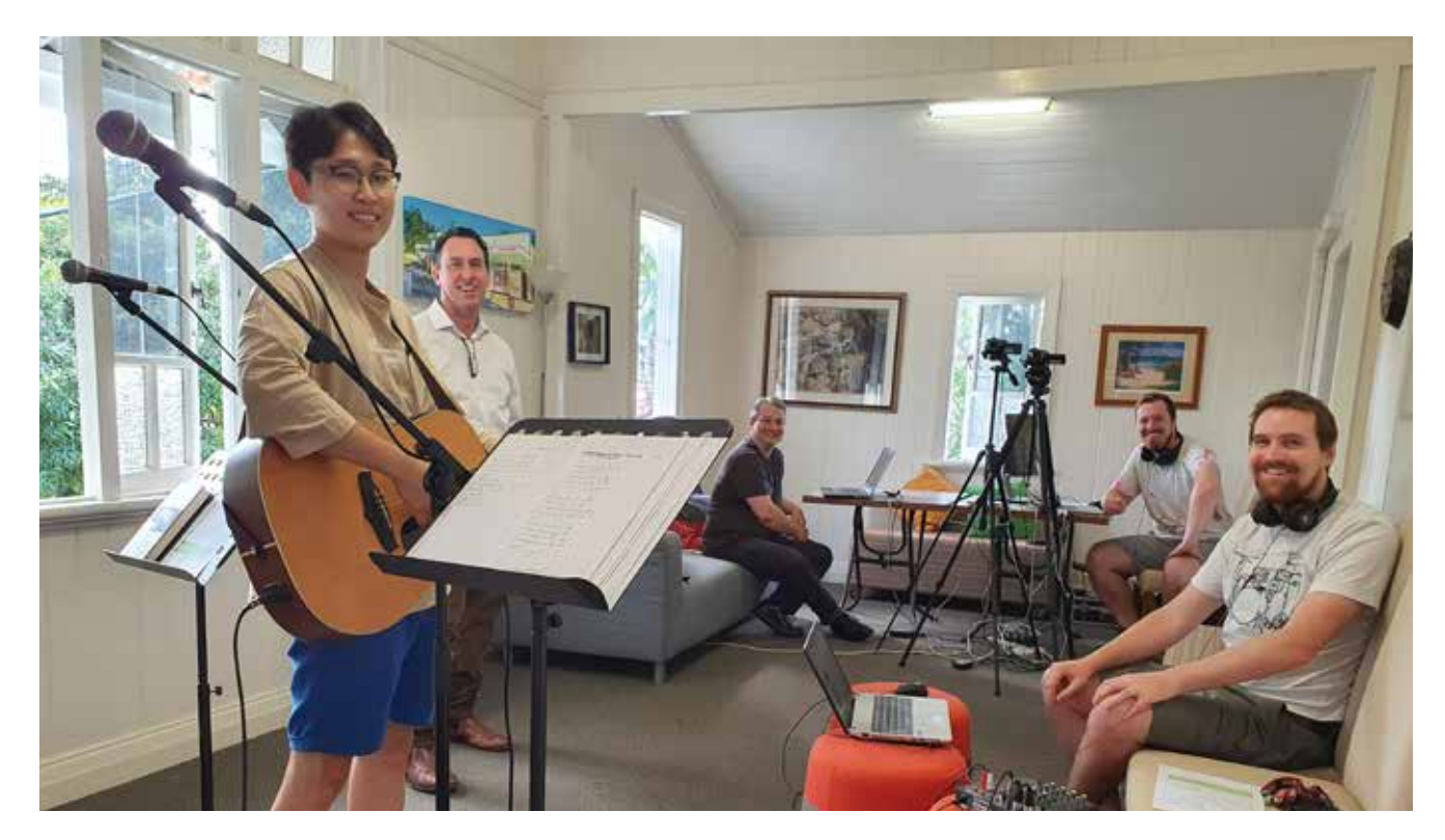
For many weeks after the initial lockdown in March, we live-streamed our Sunday worship from the church house.

2020 and the COVID-19 pandemic had significant effects on every aspect of church life, but perhaps nowhere was this more obvious than in our efforts to continue to worship together as a community despite lockdowns, cleaning regimes and capacity restrictions. It is a testament to the continued work of the Holy Spirit among us that we have maintained a life of worship and service to one another despite some of the greatest challenges our community has faced.