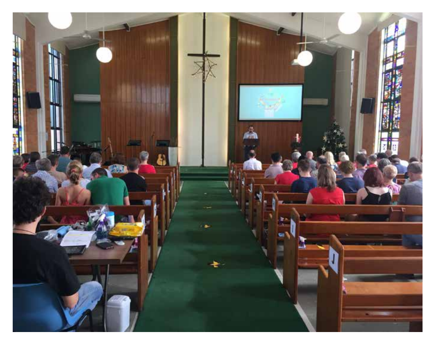
It was wonderful that we could all worship together in-person again for Christmas 2020.

streaming has increased our ability to engage people in any number of situations that would have previously been unreachable from Toowong.