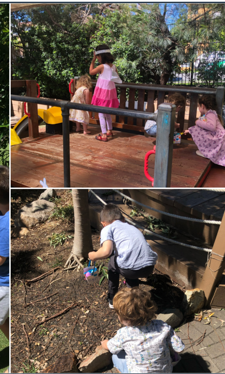
^ Easter Sunday Egg Hunt (9 April 2023)