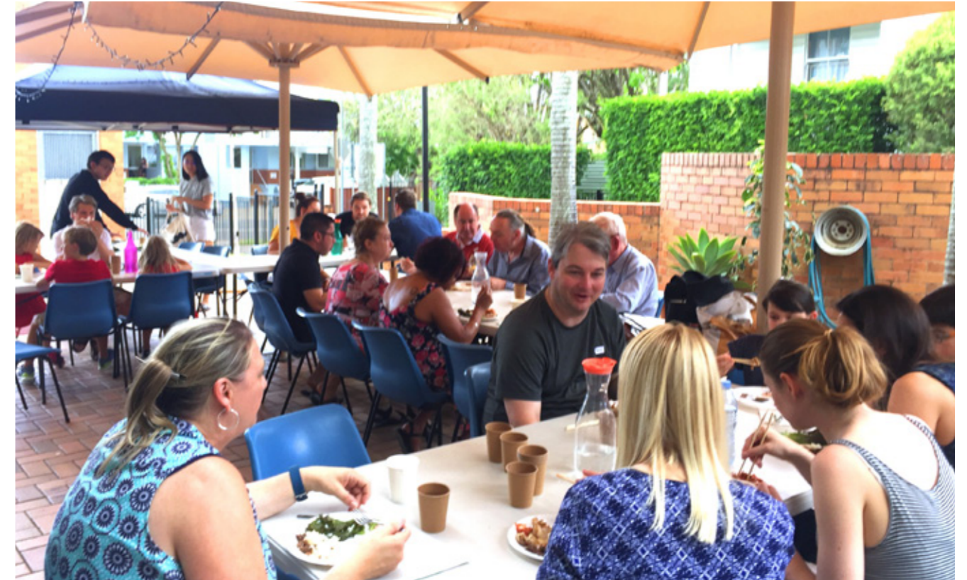
Lunch at the combined Korean/TUC Service, 25 November 2018.

The following is the Council's overview of the activities of the Toowong Uniting Church during 2018. More detail about church activities may be found in the other reports in this Annual Reports booklet.