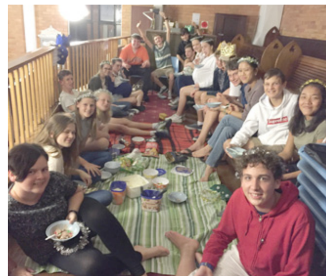
Senior Youth Group, term 1 2018.