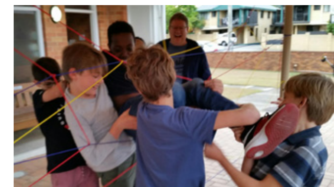
The Junior Youth Sleepover, 2018.