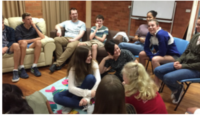
Top right: Senior Youth, term 1 2018.