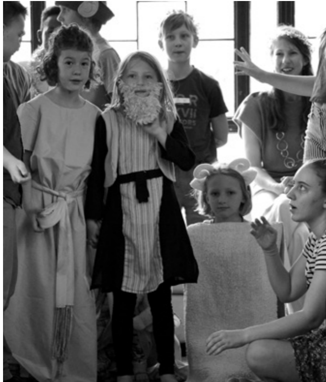
Above left: KATS Nativity Play, 9 December 2018.