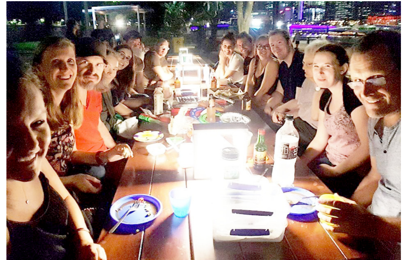
The 2018 Tuesday Pastorate Christmas Breakup at Southbank.

We continue to support and pray for those who are looking for work, or wanting to change a work environment, who have various health challenges, are moving house, have loved ones in crisis and students who are studying and face the regular stress of assignments and exams. We have also celebrated engagements and weddings, new jobs, good results, travels near and far and had lots of fun together. Anyone is most welcome to drop in anytime!