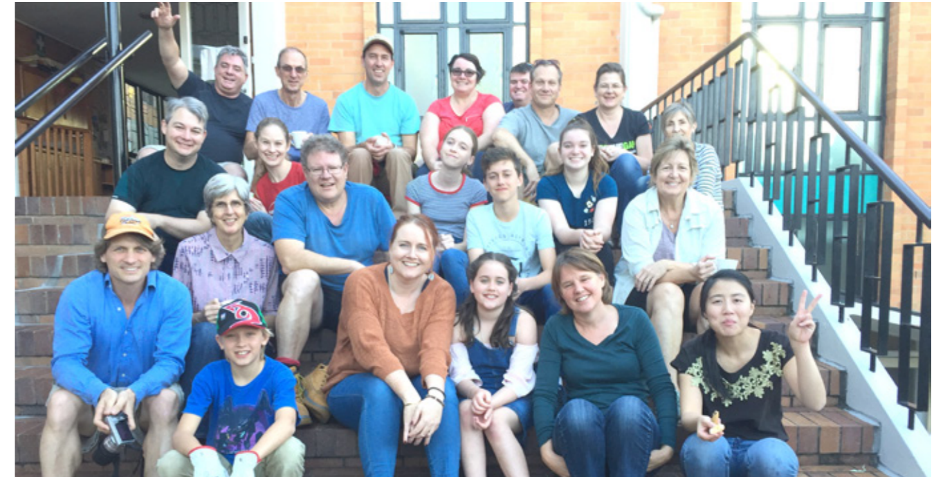
Volunteers at the Working Bee in May 2018.

There were also a number of smaller maintenance type activities carried out within our properties, such as the: