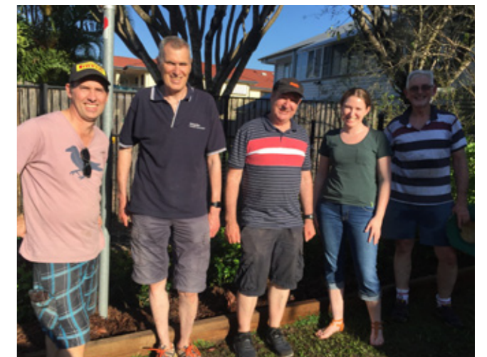
Volunteers at the Working Bee in October 2018.

The most significant maintenance costs for 2019 will be repairs to the concrete ceiling in the hall kitchen, the demolition of the bell tower, and possibly some work on the provision of a PWD (Persons with a Disability) toilet at the church level.