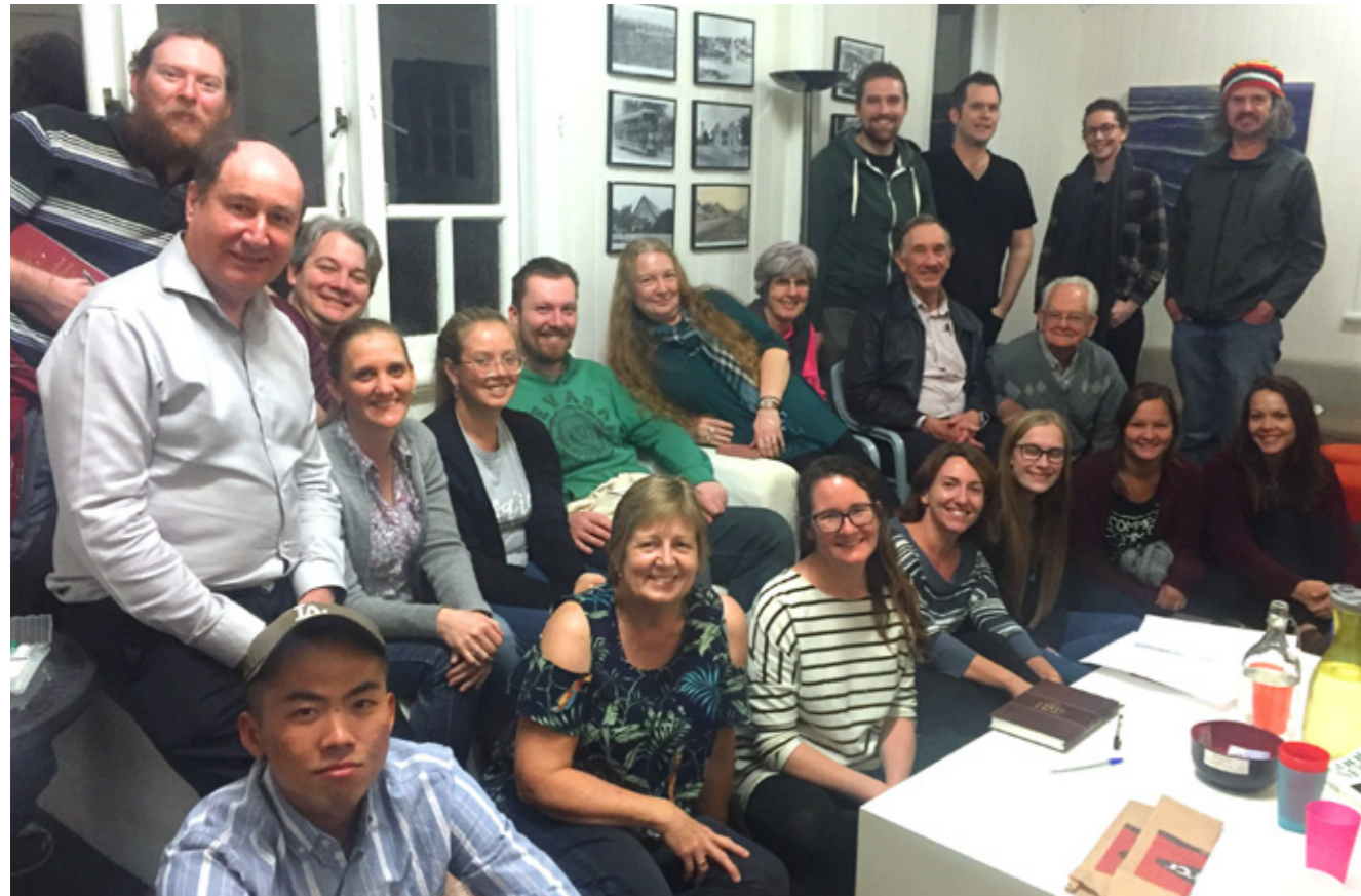
Some of the members of the TUC Terrific Tuesday Pastorate.