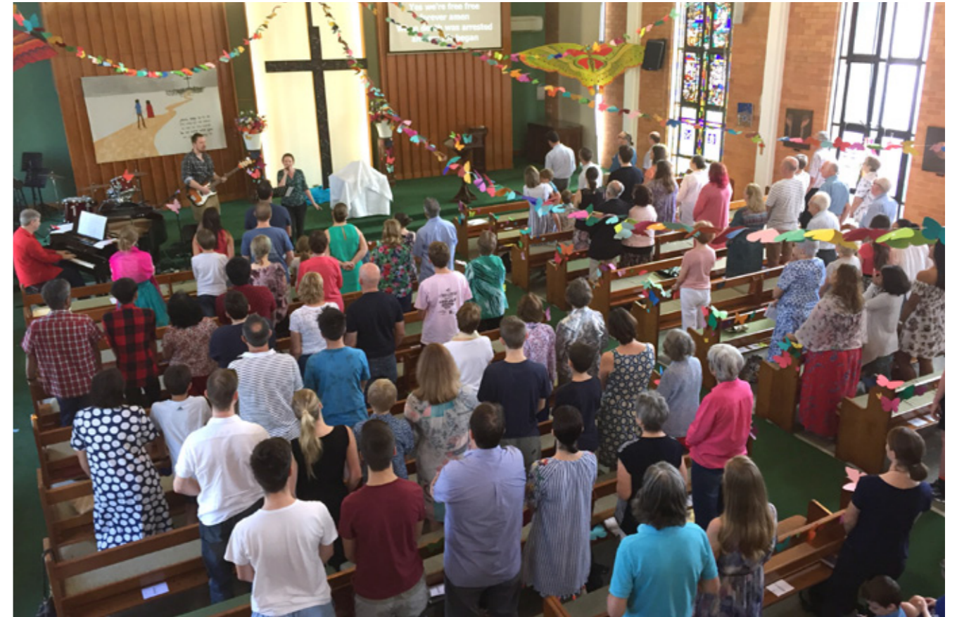
The whole church worshipping during Easter 2018.

Worship this past year has been a continual source of God's blessing. Our pool of talented worship musicians continues to grow, bolstered recently by the addition of several of our youth. We are truly blessed as a community to have such a large and capable team of musicians willing to be so generous with their time. This year we set ourselves a goal of learning a new song every quarter and we have stuck to that goal. Our youth and young adults have played a big part in helping us find and learn new music.