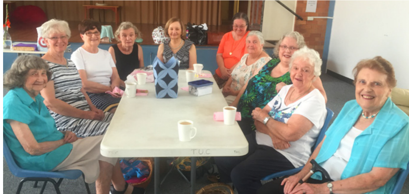
Some members of the Stitching & Friendship Group enjoying a cuppa before they get to work on their various craft projects.