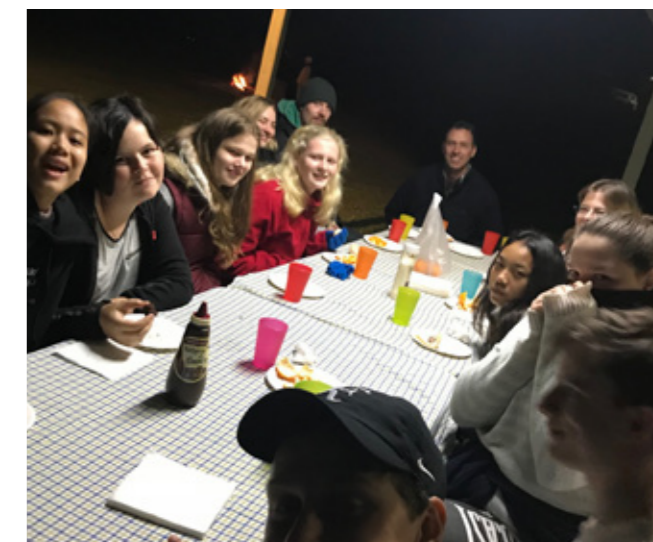
Having dinner at Senior Youth camp, 2018.