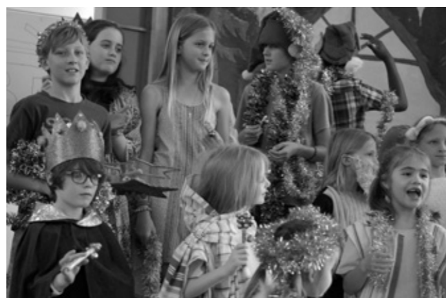
Top: Palm Sunday with the KATS and Youth. Bottom left: Special KATS craft in the foyer on Father's Day, 2018. Bottom right: Another great shot from the KATS Nativity Play, 9 December 2018.