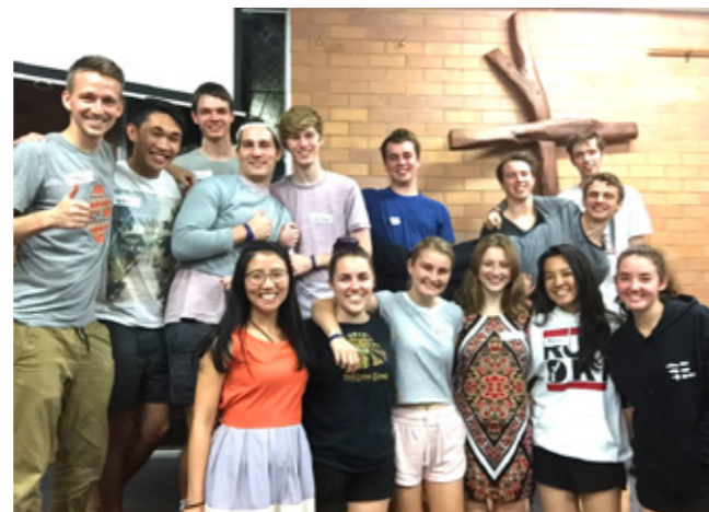
Friday night Raymont Bible study.

We want to thank TUC for the continual prayer support, encouragement as well as financial support for the ministry. We praise God for the way that He has transformed lives through this ministry and for the fruit we have seen.