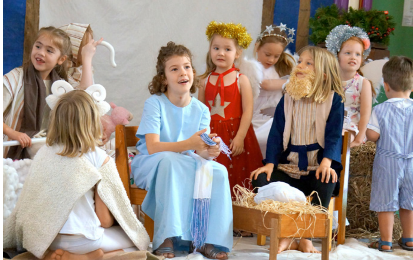
The beautiful Nativity scene from the KATS Nativity Play, 9 December 2018.

This was a very busy year for Families' Ministry with many wonderful answers to prayer and many challenges. I thank God that you uphold this ministry to Him through your prayers!