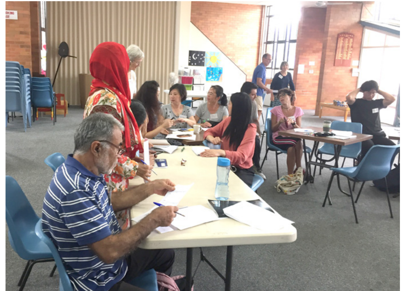
Just some of the students from the English Conversation group.