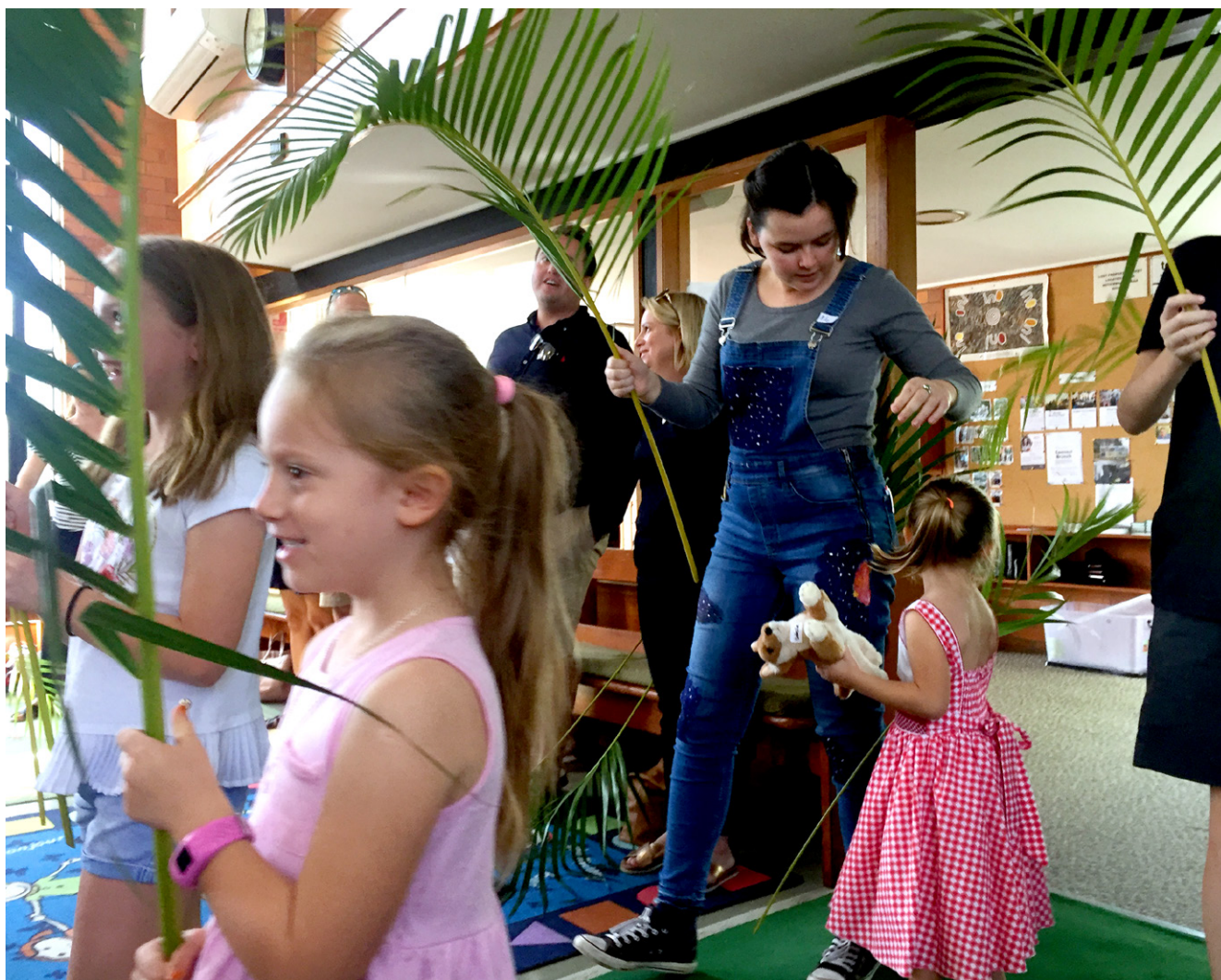
Joyful Palm Sunday celebrations with the KATS and Youth.