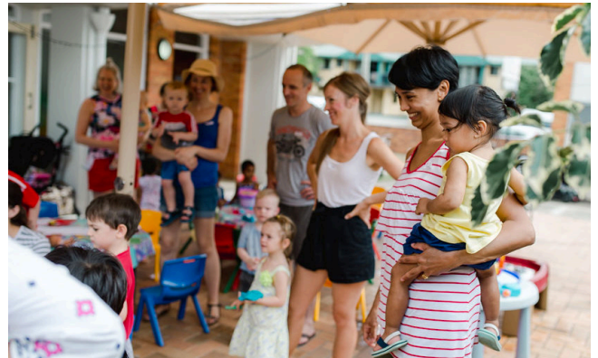
Families at Playgroup.