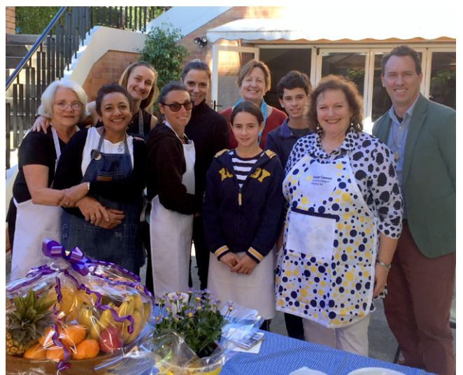
Our volunteer team at our Cancer Council morning tea.