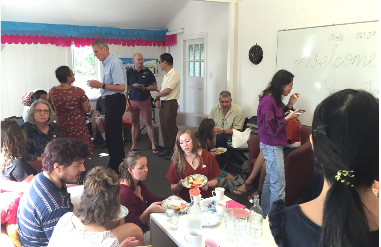
One of our Connect Brunches, on Sunday 28 April, 2019.