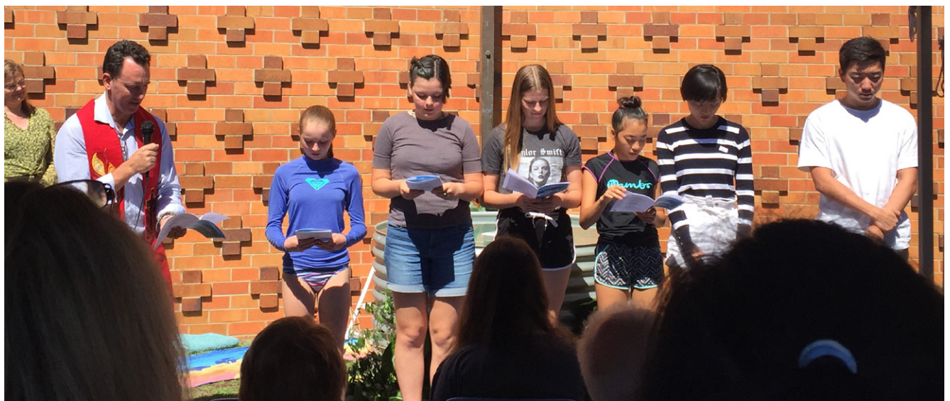
Baptism Sunday, 31 March, 2019.

The Council extends their thoughts and prayers to members of the church family who experienced poor health and also their sympathy to those who lost loved ones during 2019. May all experience a time of healing in 2020.