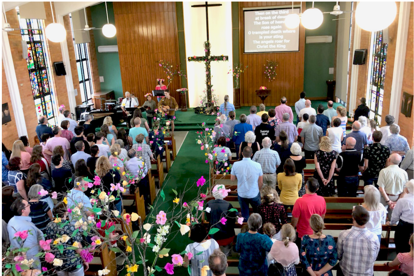
The whole church worshipping during Easter 2019.

God has continued to bless us richly in the area of worship. As a community gathered on Sunday mornings we are blessed with an abundance of musicians, technicians, preachers, readers and leaders. But most significantly, we are blessed to be part of a congregation in which God inspires heart-felt and authentic worship week after week. Highlights of the worship year included a reflective and joyous season of Good Friday and Easter, multiple baptisms of young adults, services led entirely by youth and of course a wonderful community celebration of Christmas.