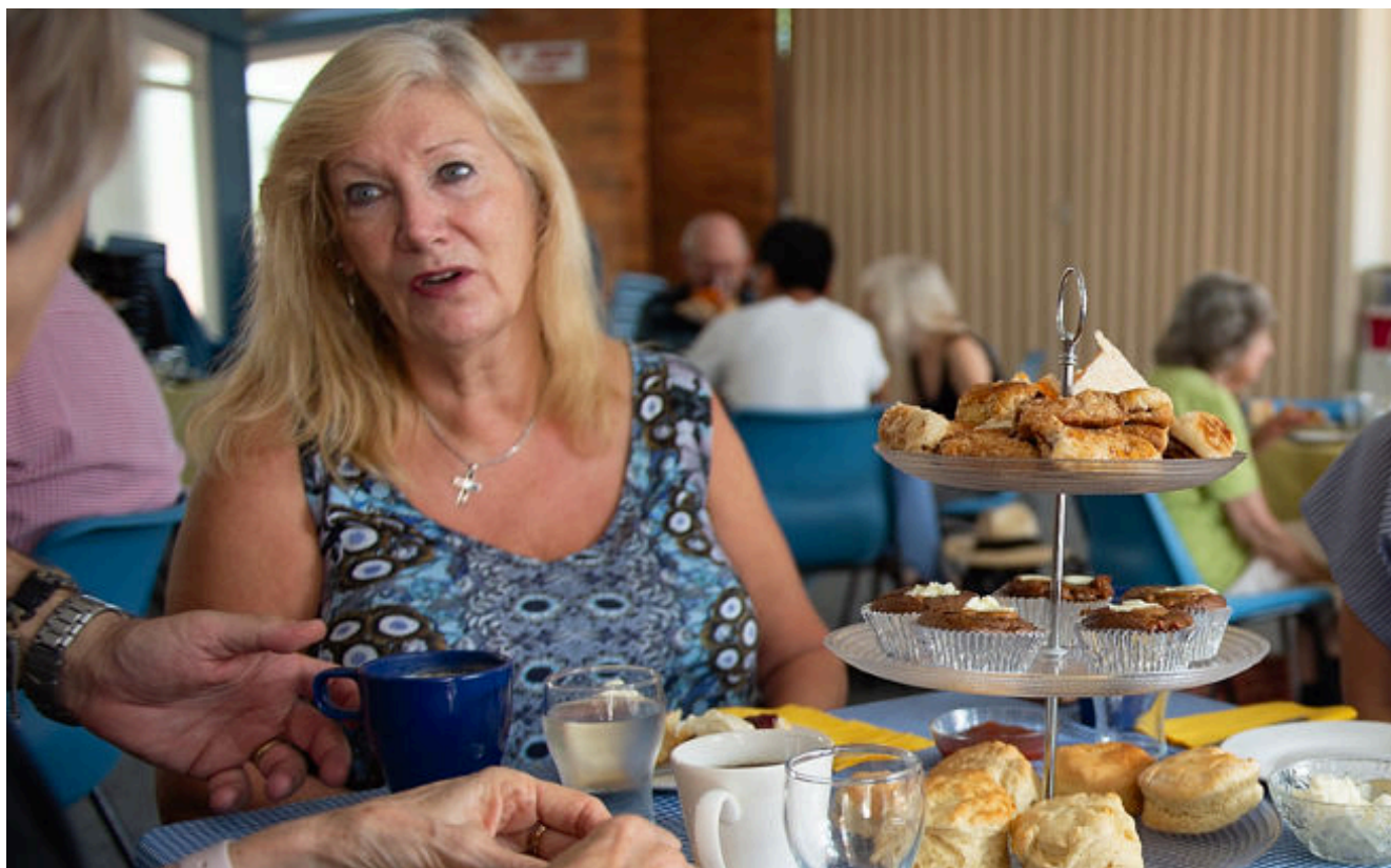
A typical scene at Morning Tea Under the Umbrellas: people chatting and enjoying delicious food!