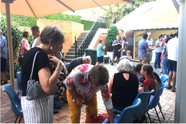
Celebrating outside on Christmas Eve, 2019.