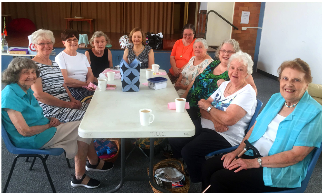
Some members of the Stitching & Friendship Group enjoying a cuppa before they get to work on their various craft projects.

Once again, our ladies enjoyed a busy and productive year in 2019. Our group comprises seventeen ladies and we meet on the first, third and fifth Tuesday of every month excluding school holidays. All ladies are welcome to join us.