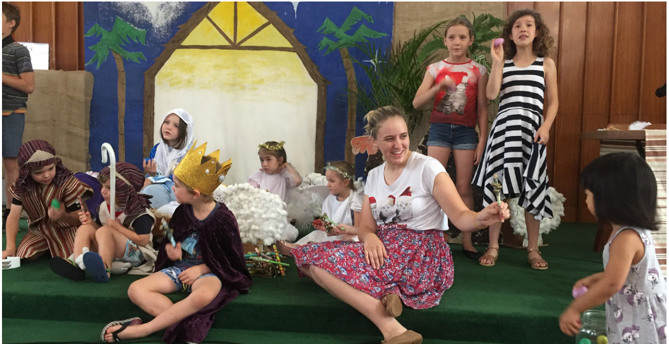
The KATS Nativity Play, Sunday 8 December, 2019.

Thank you for your continued prayer for our young families, their children and our young people and their families. It is deeply appreciated. It's good to pause and see God's work: