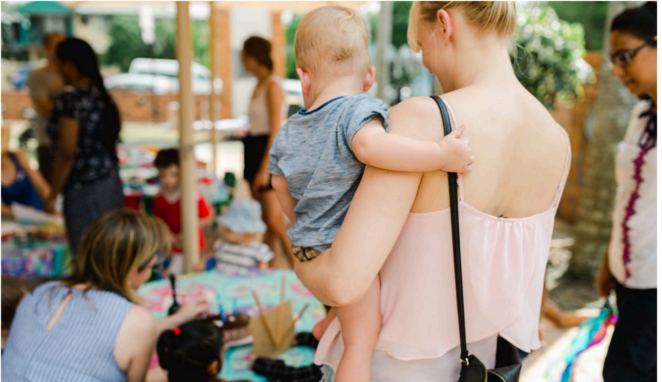
Above: Celebrating a birthday at Playgroup. Below: Members of Senior Youth hanging out on Sundays.