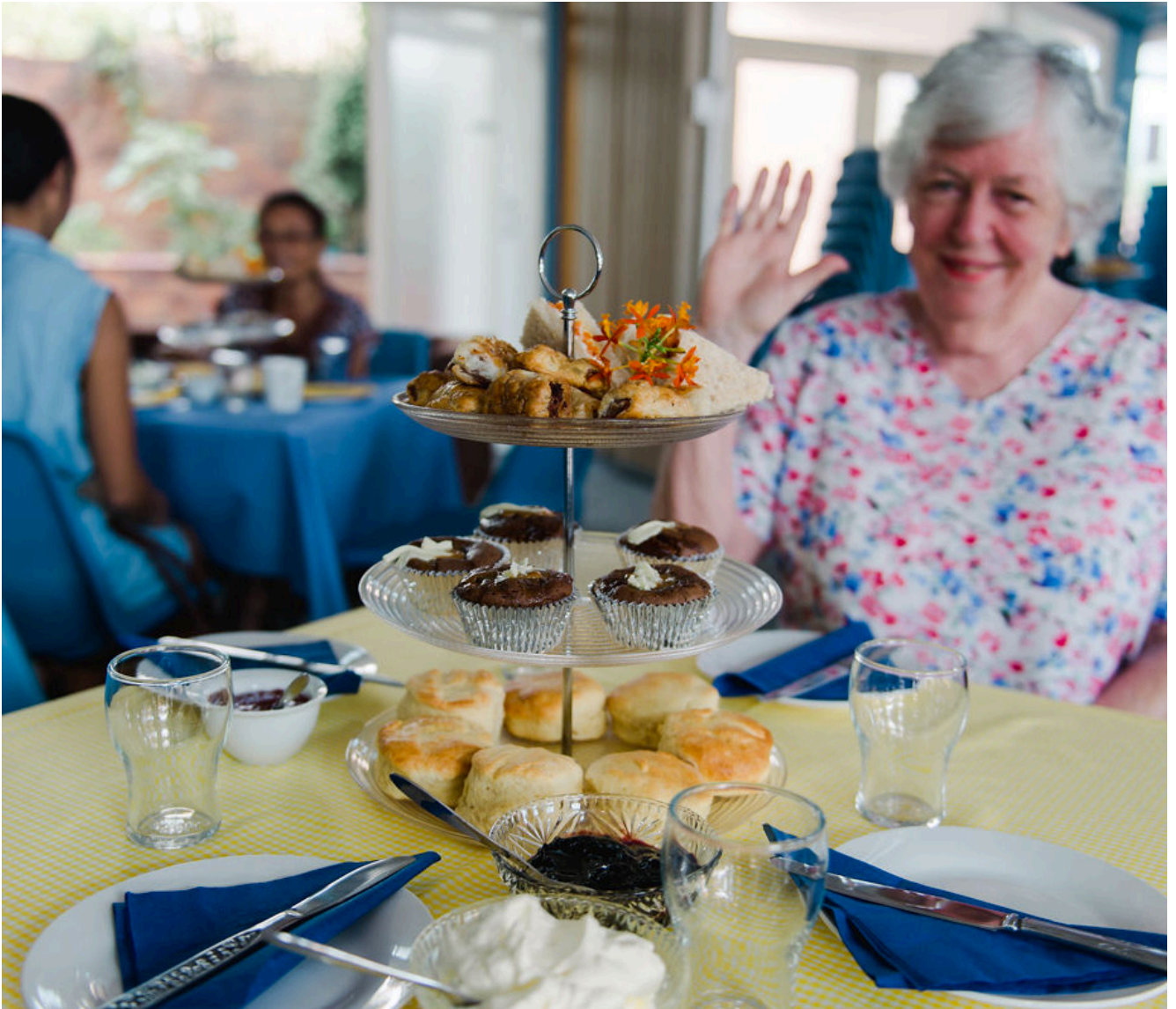
Tiers of beautiful home-baked goods.

presentation about her time living in India as part of her PhD studies.