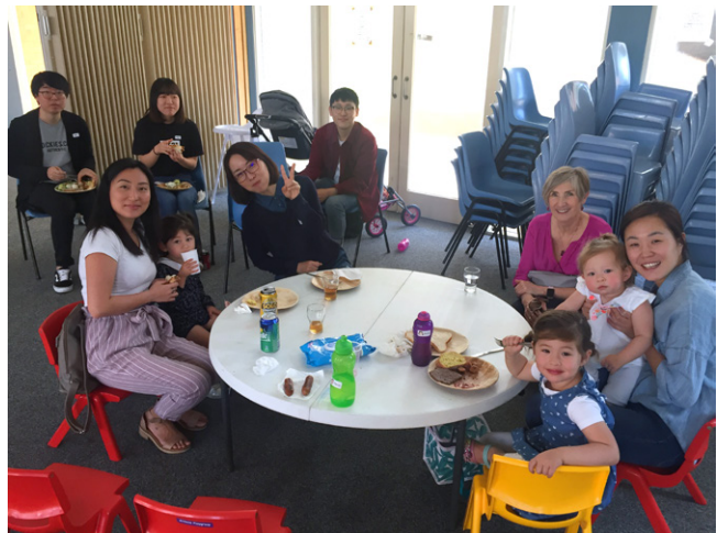
The combined TUC-Korean service on Sunday 15 September, 2019.