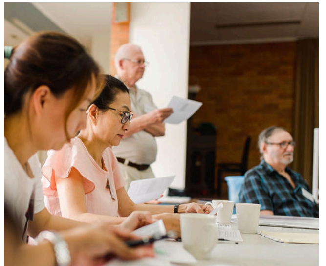
The above photos show a typical Monday at English Conversation: people of all backgrounds learning and chatting together.

Morning tea provided a break in which they and we could chat about all sorts of matters in a friendly way. In the latter part of the year, we were able to run two groups at once, offering language experience at different levels. Less confident students were given one-on-one coaching with a volunteer, where practicable.