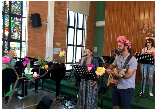
We are blessed to have so many people of all ages willing to share their gifts with us as part of the Worship Team. The above photos show just a few of the musicians.

ordered and installed with a minimum of fuss, along with an upgraded screen. We're extremely grateful for their efforts.