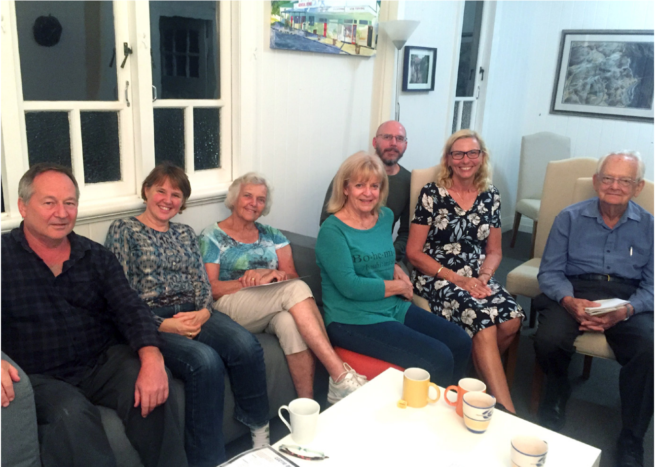
A few of the Thursday Pastorate members.