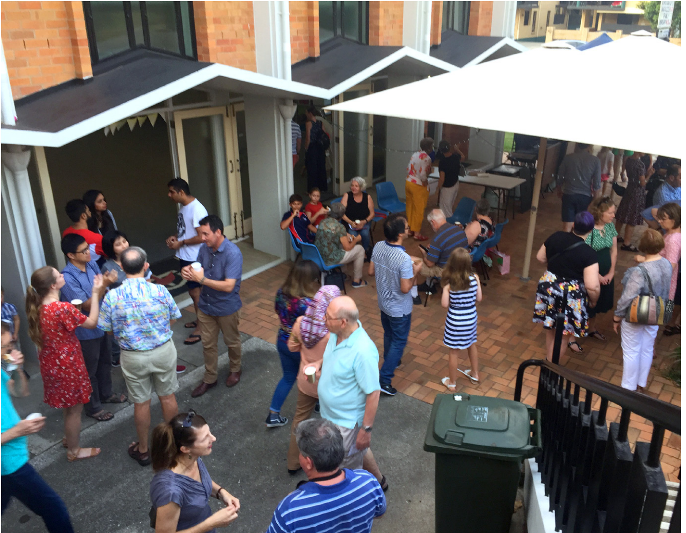
Christmas Eve, 2019.