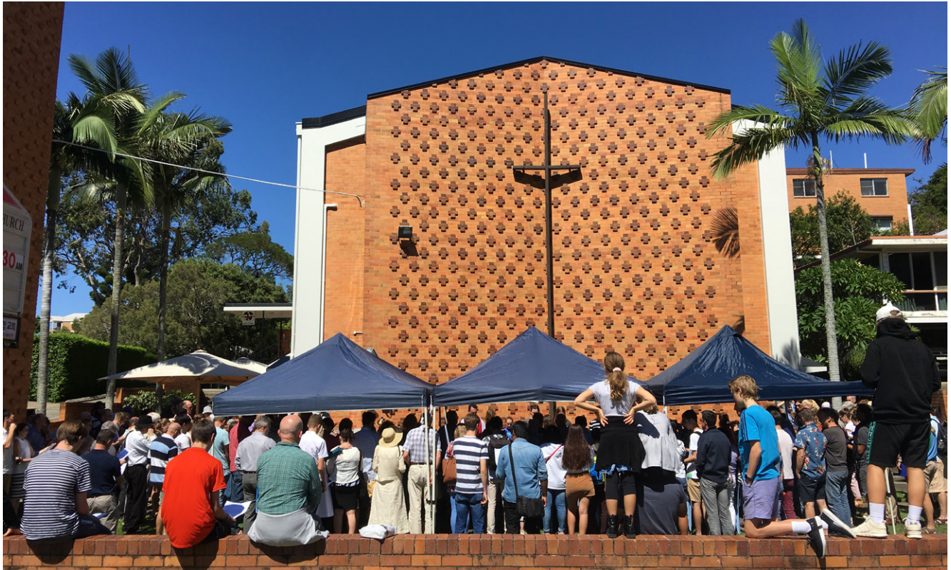
Baptism Sunday, 31 March, 2019.