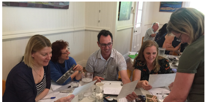
It was wonderful to have so many people join us at the Vision & Planning Day on Saturday 1 February, 2020.